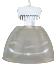
Thermalux High Bay #THB