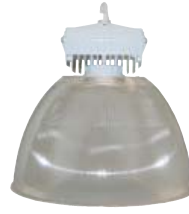
Thermalux Low Bay #TLB