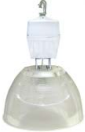
Deluxe High Bay #DHB