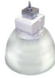
High Bay #HB