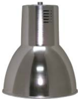
Reflector Bay #RB