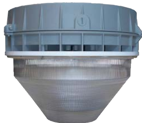
Thermalux Garage Lighter #TGARAGE

The Thermalux Garage Lighter is part of our Electronic HID line of products and is also available as an induction model! This fixture is ideal for cold storage, garage lighting, or low-bay applications. The round die-cast housing with built-in heat sink is designed exclusively for electronic ballasts. It features a white powdercoat steel reflector, extended clear polycarbonate prismatic drop lens, and Easy-Hang bracket for mounting. Max 200w PSMH or 150w Induction.